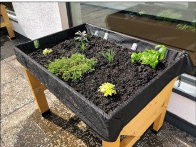
The completed planter, with all the herbs carefully planted and watered in.