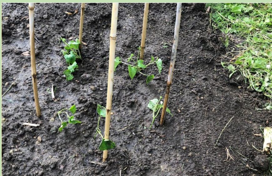
Newly planted runner beans around a wigwam students built.