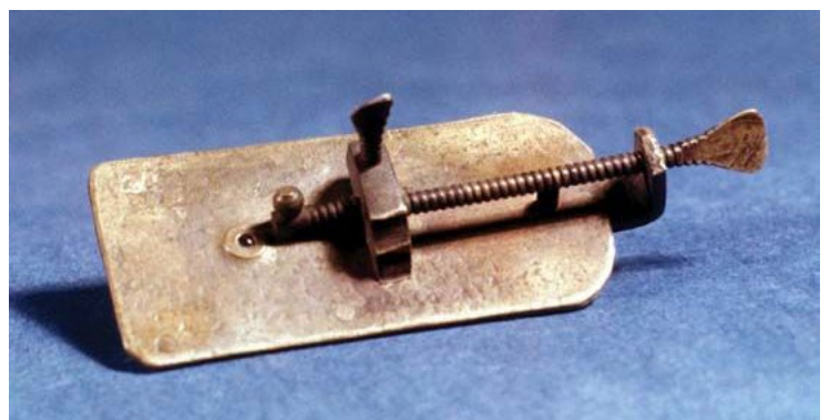
One of Antonie van Leeuwenhoek's original microscopes

Even stationary cells exhibit movement within their cell structure. However, perhaps because he was not a trained scientist, many were at first suspicious of his claim that a vast unseen world of life exists all around us. Now of course we understand that although some microorganisms are harmful, all life on earth is dependent on our microscopic cousins. They recycle the nutrients in the biosphere and maintain the composition of the atmosphere. Their existence and the roles they play would have remained unnoticed without the invention of the microscope.