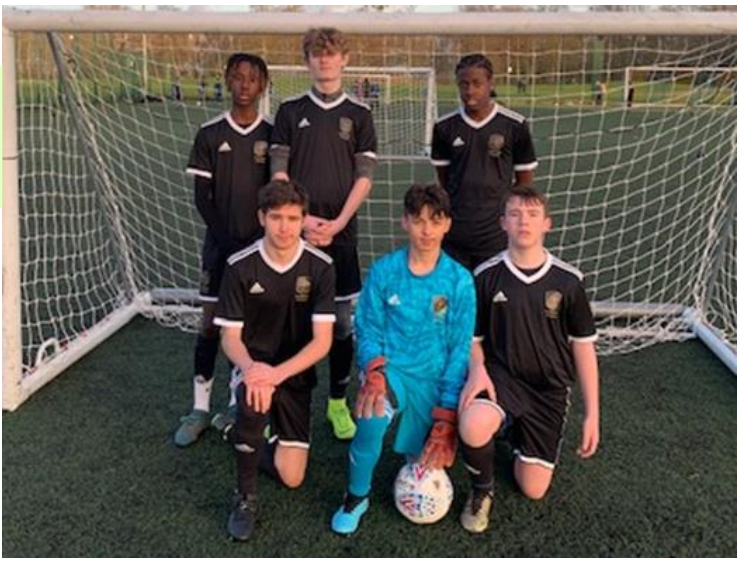
Team B competed in group 3, where they played 3 games, lost two games and drew 1 game. This also meant that they would not make the play offs.

This meant that they also crashed out of the competition at the group stage. However, these were Year 9 pupils who were testing themselves against Year 10 pupils, so they left with their heads held high.