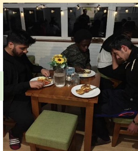
Some of our students dining together at the youth hostel.