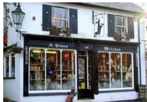
A Coven of Witches shop in Burley.

Year 12 and 13 geography students recently spent 2 days in the New Forest National Park as part of their fieldwork investigation which was highly beneficial to their course. By 9:30 they were on their way to the youth hostel where they would be staying. As soon as they arrived, the fieldwork had begun. They explored the small village of Burley where they found shops that reflected the history of witchcraft in the town. In order to conduct their human fieldwork, the students drew a sketch map of the village.