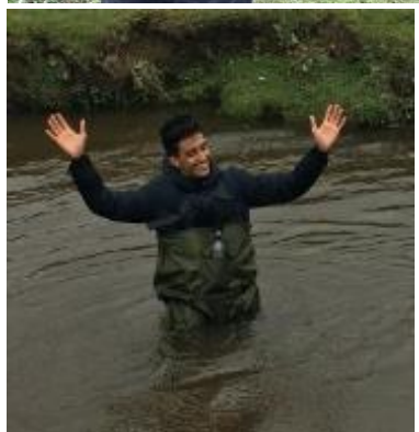
Salman seemed to be enjoying himself.

After a busy 2 days, the students finally left to come back to London, having learnt many useful skills to help them with their Geography A Level