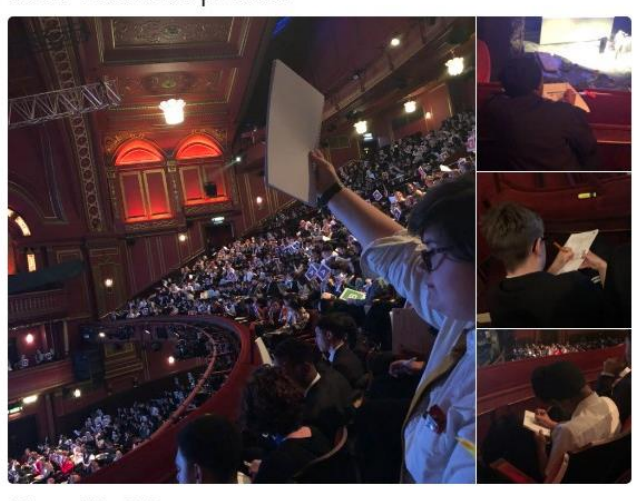
4:05 am - 4 May 2018

Studious @SouthfieldsAcad Year 11s making their teachers proud!